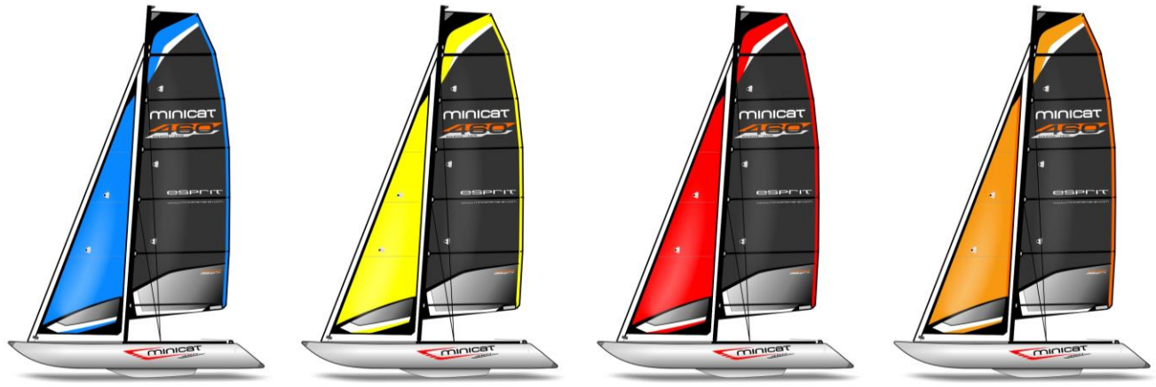
m 0801 m 0802 m 0803 m 0804